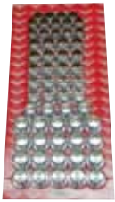
VF0713-FLSK TOP HAT FREIGHTLINER

FL FRAME KITS - REQUIRES 2 KITS TO COMPLETE 1 FRAME.