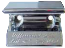
VF424-DL DIFFERENTIAL LOCK