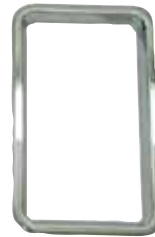
VF404-HVF FL HEATER VENT COVER