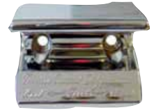
VF424-TCF TRACTION CONTROL FRONT