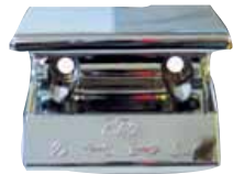
VF424-PTO POWER TAKE OFF