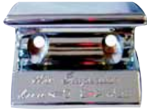
VF424-AS AIR SUSPENSION