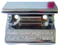
VF424-TCR TRACTION CONTROL REAR