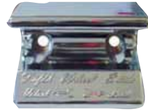
VF424-FW FIFTH WHEEL