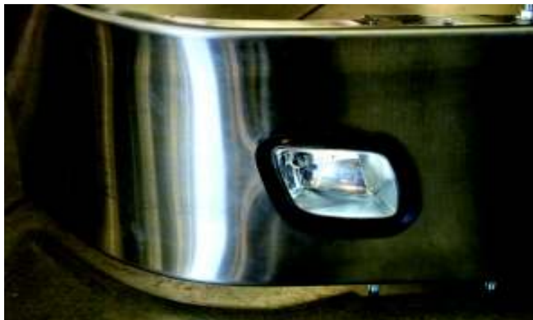
View of Fog Light after installation.