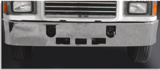
CH600 set forward axle 1994-2004 ABP N31 OGJ221018 fog lights (shown) ABP N31 OGJ021018 no fog lights