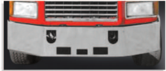
CH600 set back axle 1994-2004 ABP N31 OGL221015 fog lights (shown) ABP N31 OGL021015 no fog lights