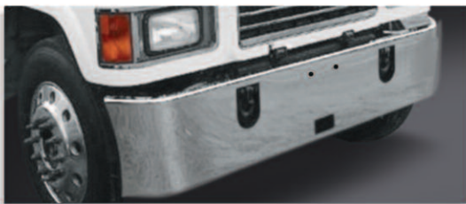
CHN set forward axle 2005-2007 ABP N31 OGX121019 fog lights ABP N31 OGX021019 no fog lights (shown)