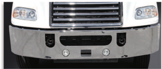
CXU set back axle 2008-newer *ABP N31 OGY121116 fog lights (shown) *ABP N31 OGY021016 no fog lights, no vent * Replaces clad bumpers. For urethane bumper replacement, also order brackets ABP N31 GY0116BK