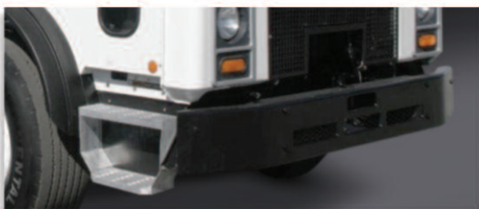
MR, MD Series ABP N31 PGP001112 -painted (shown) ABP N31 OGP001112 -chrome